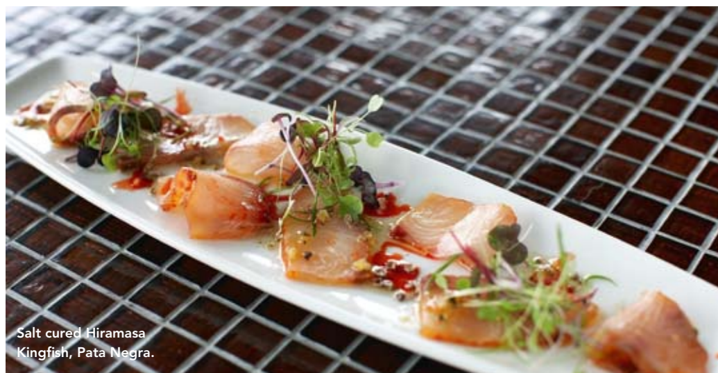
Salt cured Hiramasa Kingfish, Pata Negra.

Winner of Redback's Gourmet Pub of the Year (as part of the judging panel, Scoop can vouch for Clancy's place atop the podium), Fremantle institution Clancy's Fish Pub celebrates 21 years this October. To mark the milestone, the pub has organised a week of activities from October 19 to 25 that includes serving the original 70s menu from the pub's forerunner, Clancy's Tavern, a pub cook-off and live entertainment. Clancy's Fish Pub, 51 Cantonment Street, Fremantle. (08) 9335 1351