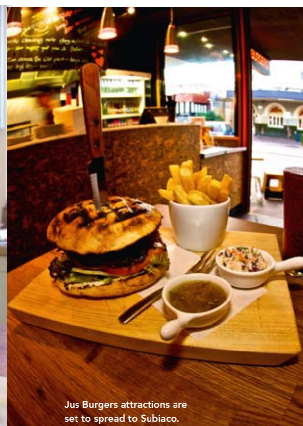
Jus Burgers attractions are set to spread to Subiaco.

The concise wine list covers considerable breadth in its selections and in great news for locals, Gigi's is open for dinner Sunday and Monday. Gigi's on George, 125 George Street, East Fremantle. (08) 9339 0099.